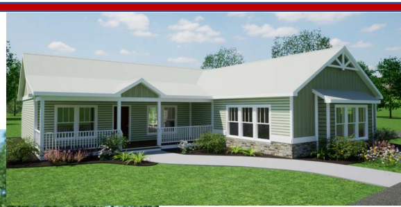
ELEVATION A Shown with site built garage