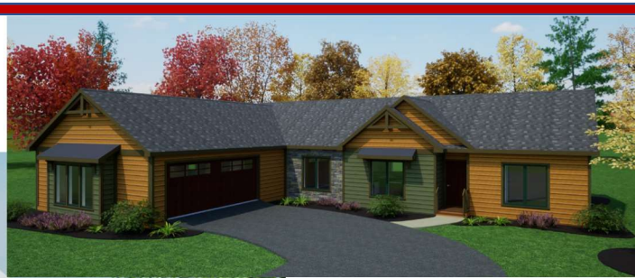
ELEVATION A Shown with site built garage