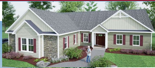
ELEVATION A Shown with site built garage