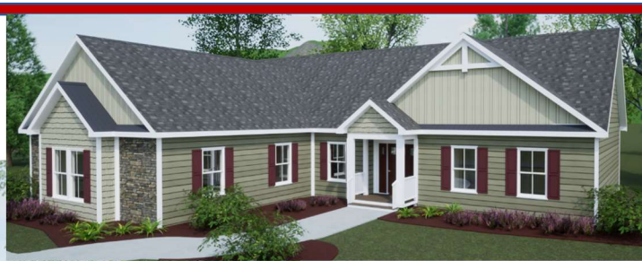
ELEVATION A Shown with site built garage