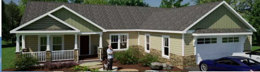
ELEVATION A Shown with site built garage