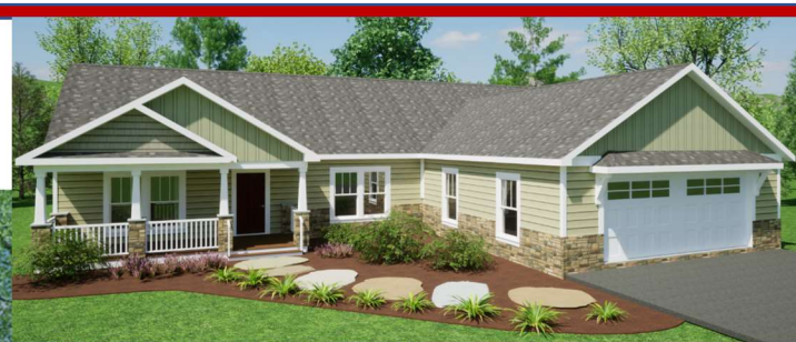
ELEVATION A Shown with site built garage