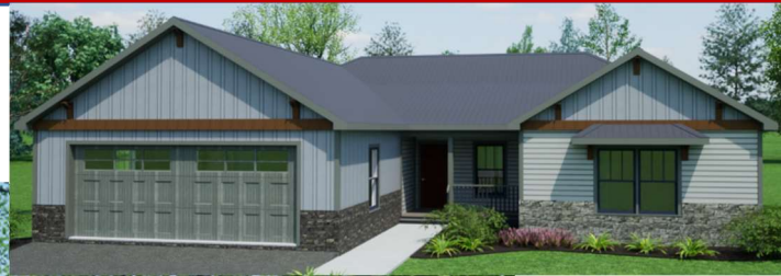
ELEVATION A Shown with site built garage