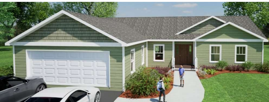
ELEVATION B Shown with site built garage