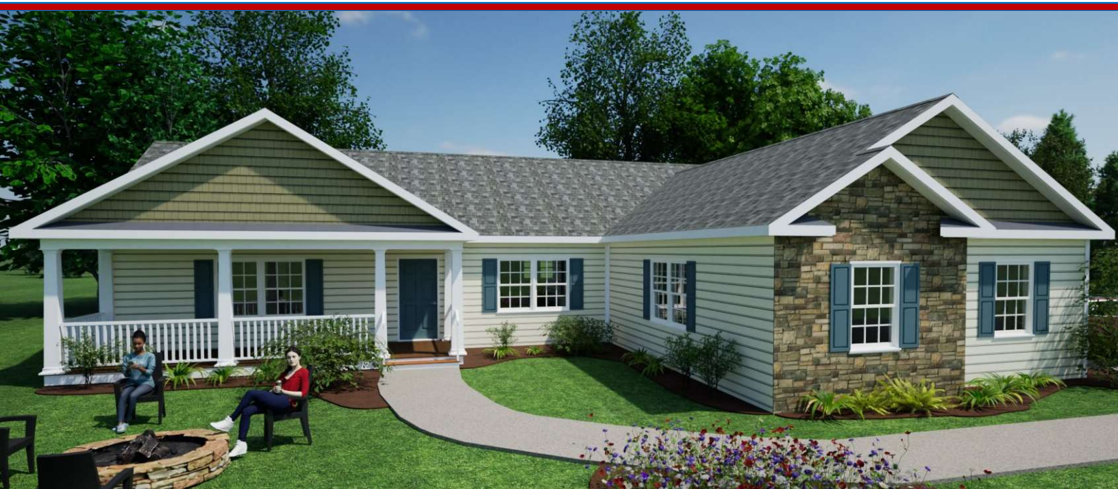
ELEVATION A Shown with site built Garage