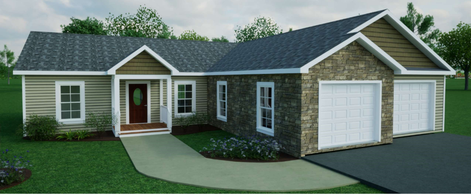
ELEVATION A - Shown with site built garage