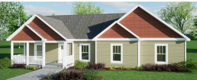
FLOOR PLAN Matches Elevation B rendering

Optional decorative exterior features that are shown on renderings are not included in default pricing. Always refer to sales order for exact specifications and options.