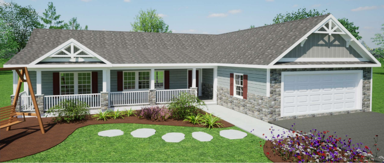
ELEVATION A - Shown with site built garage