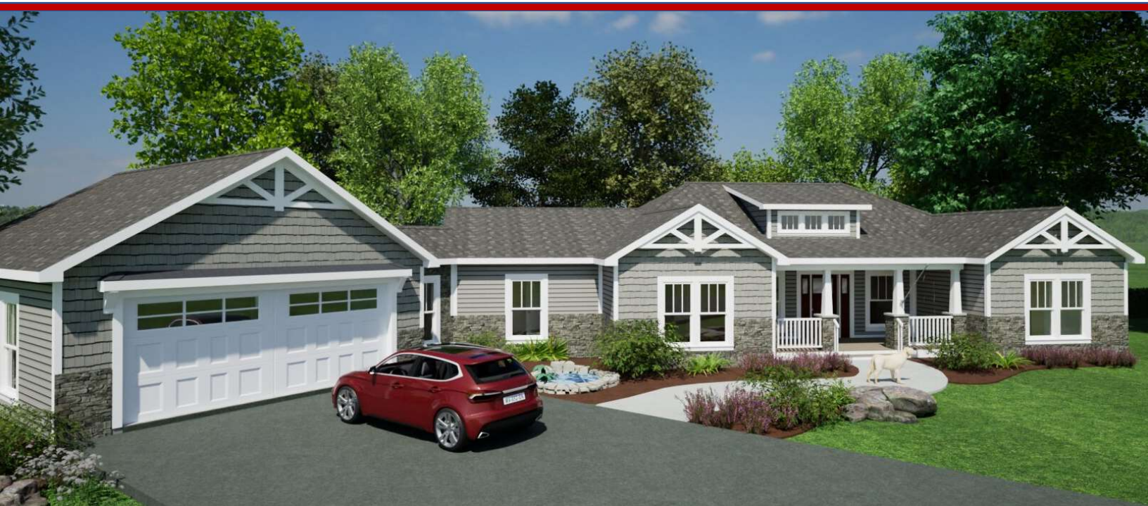
ELEVATION Shown with site built garage