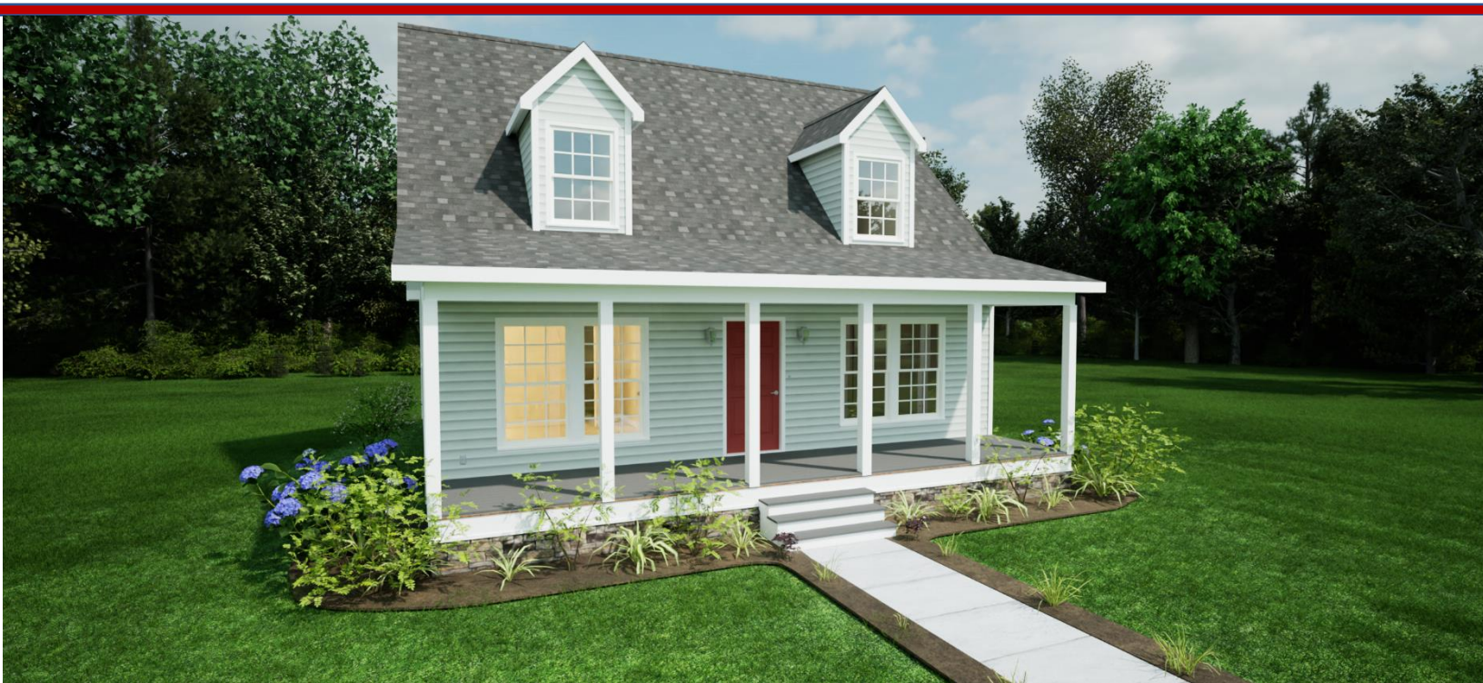
ELEVATION C SHOWN